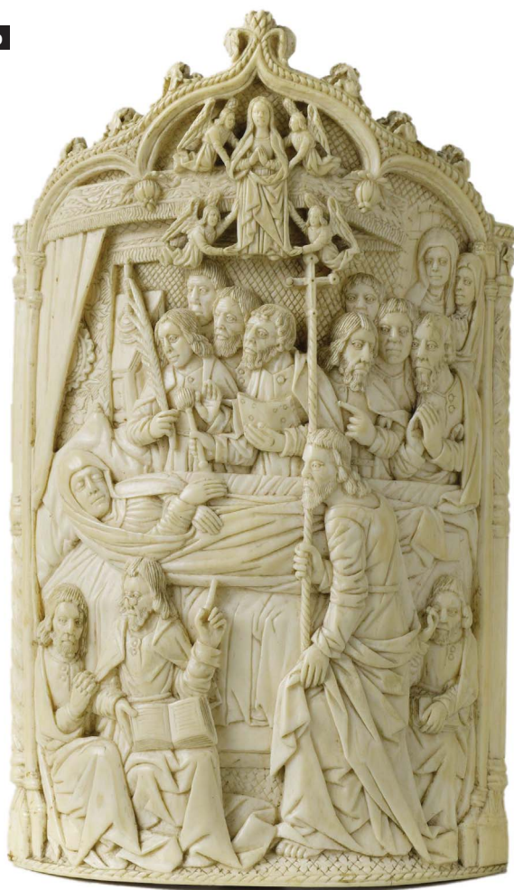
9. Pax with the scene of the Dormition of the Virgin Mary , ca. 1480–1500, ivory, 12.7 × 21.3 cm, Rijksmuseum in Amsterdam.