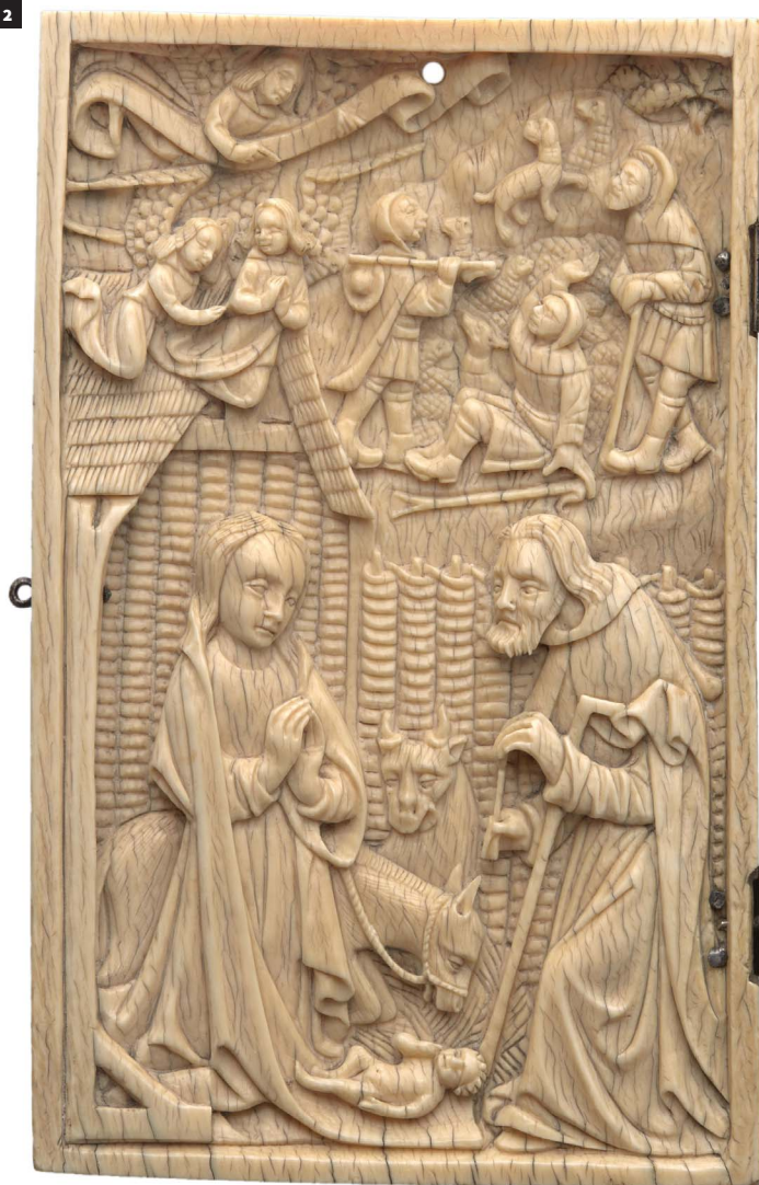
2. Left wing of the diptych – Nativity of Christ , ca. 1500, ivory, metal, 7 × 18.5 cm, National Museum in Kraków, Princes Czartoryski Museum.