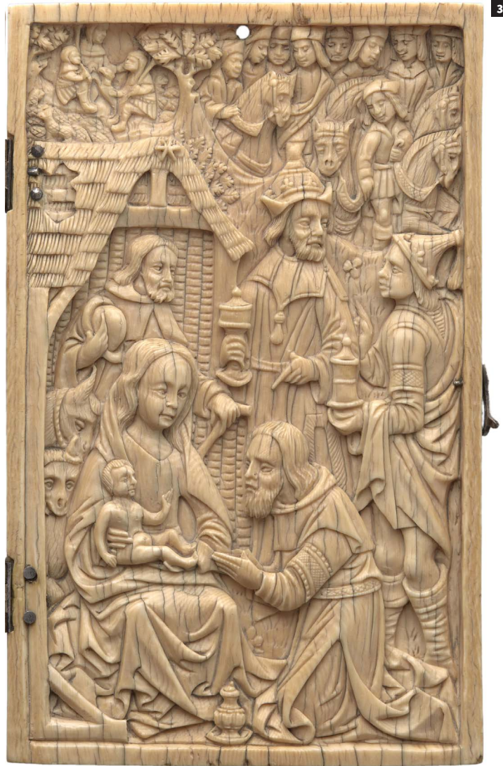
3. Right wing of the diptych – Adoration of the Magi , ca. 1500, ivory, metal, 7 × 18.5 cm, National Museum in Kraków, Princes Czartoryski Museum.

ever, the ivory trade did not stop completely. This material was still used, albeit not in all their works, in the circle of the Italian Embriachi workshop (active first in Florence, and then in Venice). 24 Their somewhat stiff and conservative style of figures clashed with the new, more naturalistic tendencies developing in Northern and Central Europe. 25 The Embriachi workshops were well recognized due to their accessibility and the lower prices they offered, but the Northern European workshops still functioned, produced, and developed new iconography well into the fifteenth century. However, these workshops and artistic centres have definitely received less recognition than the earlier ones, which had been studied much more carefully since the beginning of twentieth century. 26 Many researchers dismissed