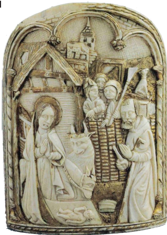
13. Pax with the scene of the Nativity of Christ , last quarter of the 15 th century, ivory, gilding, 10 × 14 cm, Palazzo Madama – Museo Civico d'Arte Antica in Turin.

As the example of the strong influence of d'Ypres engravings, Yvard also mentioned a silver, niello diptych in New York, dated around 1500 78 and attributed to the Parisian workshop, 79 repeating the scenes of the Nativity and the Adoration of the Magi (see: Fig. 14). Also in this case, the composition was not carefully repeated; there are some slight differences between the silverwork and the engraving as well as the ivory, especially in the formation of the folds of the robes, the lack of canopies or niches. The landscape was expanded in comparison to the ivory in Kraków – the buildings were added in the background, mainly in the scene of the Adoration . In both cases, the architectural decoration was reduced, but in the Kraków diptych the elements of the landscape were limited in favour of the foreground characters. Despite these differences, there is no doubt that both works share many similarities and were based on one prototype, which was the Jean d'Ypres engraving – maybe they even influenced one another. Almost all the ivories based on the d'Ypres works share the obvious similarities to their models – such as full, round faces, realistic features with visible pupils carved into the material, as well as heavy, rich folds of the outfit's fabrics. Most of the ivories, especially the paxes , also repeat the expanded architectural decoration visible on