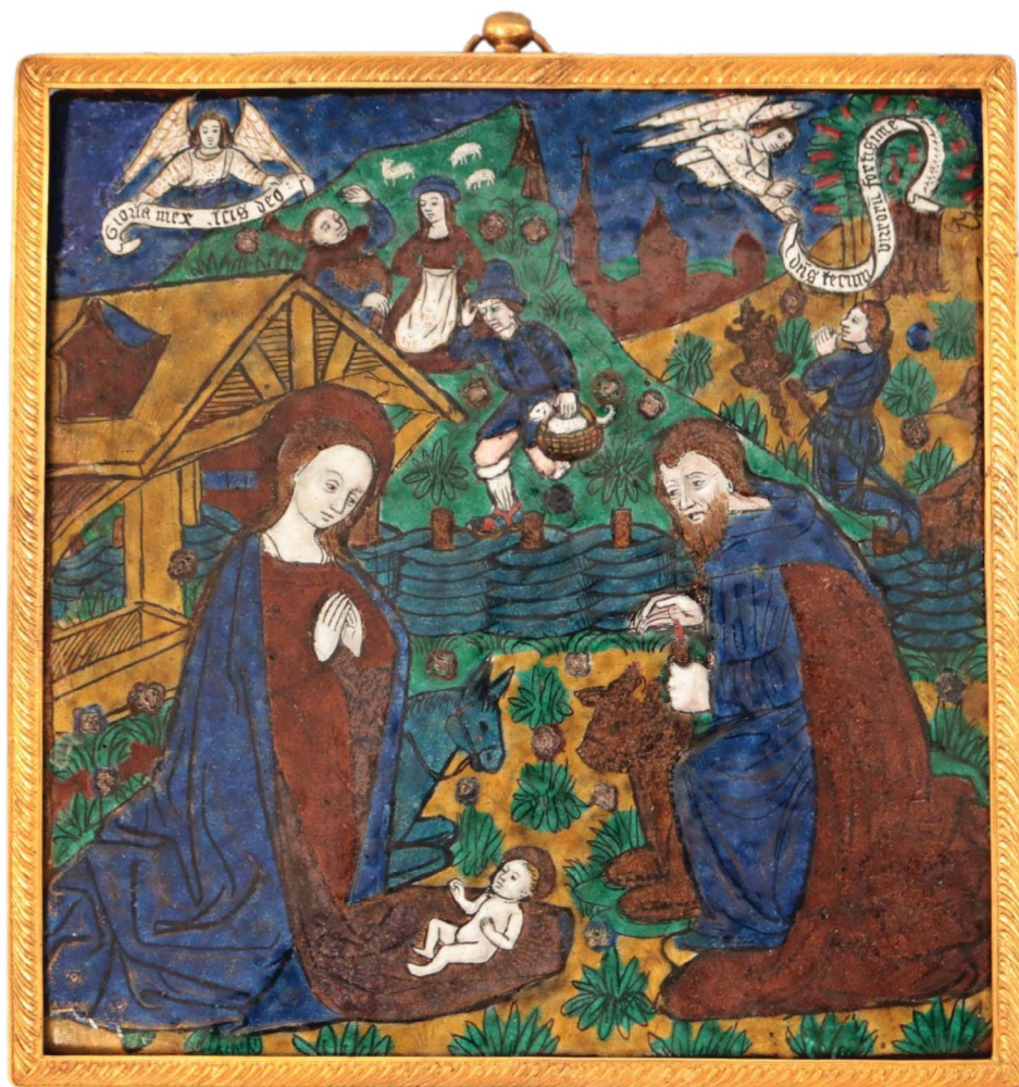
15. Plaque with the scene of the Nativity of Christ , 1450–1500, enamel, gilded silver, 19.9 × 19.4 cm, National Museum in Kraków, Princes Czartoryski Museum.

from the other ivories modelled on the engravings (their characteristic style seems to suggest production in the same artistic centre, most likely Netherlands). Another feature linking our ivory and the enamelled plaques is the lack of any architectural, expanded decoration of the borders. Similarities between later ivories and enamels were unfortunately never the subject of broader studies and should definitely be explored in the future. As early as in the middle of the thirteenth century there are some possible cases of ivories being produced in the same workshops as the monumental sculpture 82 – it is likely that enamels and ivories could have been manufactured by the same workshops, or maybe even the same artists in a similar manner.