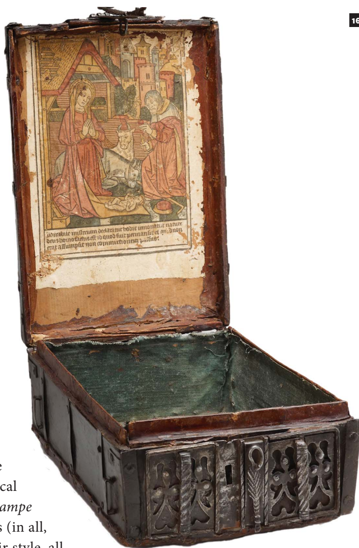
16. Coffret à estampe with the print with the scene of the Nativity on the cover, ca. 1490, wood, leather, iron, woodcut, 23.1 × 16.4 cm (woodcut); 22 × 33 × 15 cm (box), Art Institute of Chicago.

The number of surviving ivories following the compositions of the Jean d'Ypres series of engravings as well as the other printmakers, show the power of the print as an artistic medium. Most of those print-based ivories are small, devotional objects such as diptychs and paxes made to worship and touch from a close distance, preferably in the surroundings of the owner's room or a private chapel. The diptych in Kraków, which serves as the representation of this group, with certainty can be seen as an object of private devotion or "the medieval domestic devotion". 90 The production of those objects – relatively cheap, unlike the paintings or monumental