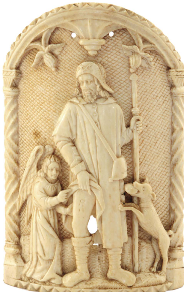
10. Pax with Saint Roch , end of the 15 th century, ivory, 9.5 × 15 cm, Museo Correr in Venice.

1496 and 1508. 62 He was a skilled painter and engraver but also practised in various fields of decorative arts, such as gold, silver, and enamel. 63 He is thought to be the author of a series of engravings (metalcuts) for the popular book of hours ( Horae Beatae Mariae Virginis ad usum Romanum ), specifically their earliest edition, dated precisely on 22 May 1496, printed by Simon Vestre (or Vostre). 64 In museum collections all over the world, several other copies of this manuscript have survived, including a single copy at the Princes Czartoryski Library in Kraków. 65 Yvard and Reesing, distinguished a fairly large group of ivories, the compositions of which follow closely the images illustrating the manuscript. The most duplicated composition from the Hours were the scenes of the Dormition of Mary (see: Fig. 9), 66 and of the Crucifixion , shown on the whole series