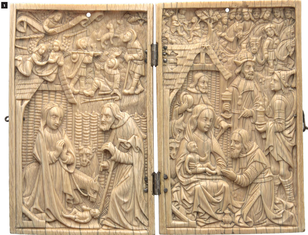
1. Diptych with the scenes of the Nativity of Christ and the Adoration of the Magi , ca. 1500, ivory, metal, 14.5 × 18.5 cm, National Museum in Kraków, Princes Czartoryski Museum.

popular media, and their iconography and style were changing along with the prototypes they followed, such as monumental and funerary sculpture, illuminated manuscripts, etc. This diptych certainly can be viewed as an example of a work used for such practices. In this study, I would like to place the diptych within its artistic and iconographical tradition, as well as present it as the work of art that is somewhat typical for its period. Later ivories were rarely viewed as the mirror of new artistic tendencies.