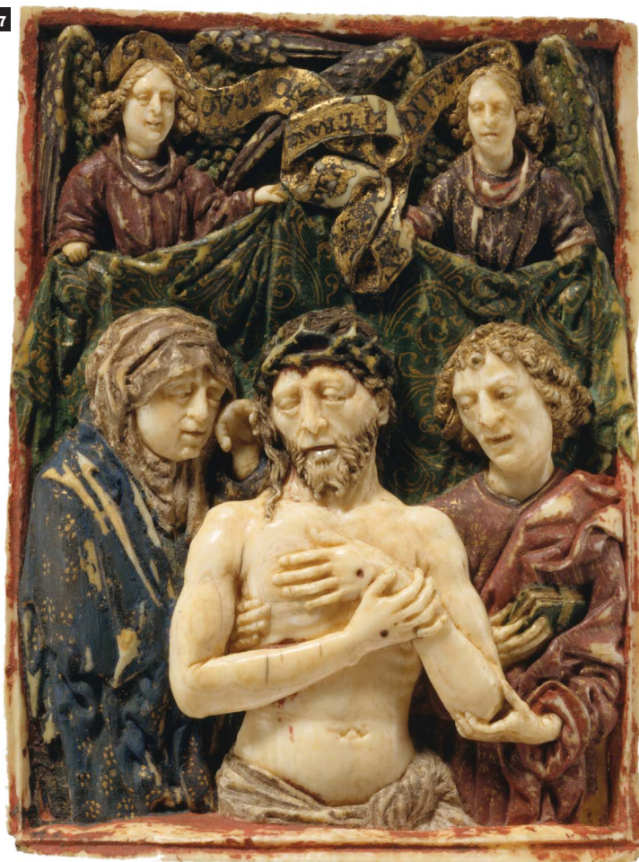
17. Relief with the Man of Sorrows , ca. 1500, ivory with paint and gilding, 8.6 × 6.5 × 1 cm, Metropolitan Museum of Art in New York.

Martin Schongauer. 94 The ivories based on the Jean d'Ypres works certainly fit into the same phenomenon.