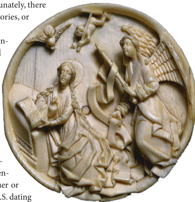
4. Medallion with the scene of the Annunciation , ca. 1470, ivory, 10.2 cm, Cleveland Museum of Art.

and a triptych with painted wings in Lyon (Musée des Beaux-Arts, inventory no. L 422), dated between 1270–1300. For more information, see: Images in Ivory. Precious Objects of the Gothic Age (exhibition catalogue, Detroit Institute of Art, 9 March – 11 May 1997, Walters Art Gallery in Baltimore, 22 June–31 August 1997), P. Barnet (ed.), Detroit, Mich. – Princeton N.J. 1997, p. 59, fig. IV-10.