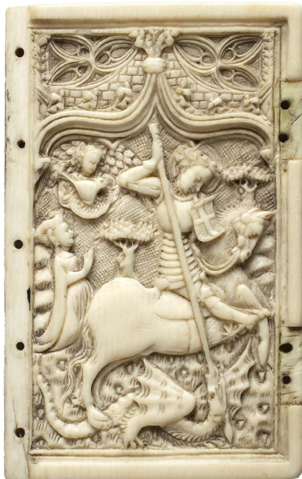
5. Left wing of the diptych with the scene of Saint George slaying the dragon , 1440–1470, ivory, 4.8 × 7.7 cm, Princeton University Art Museum.