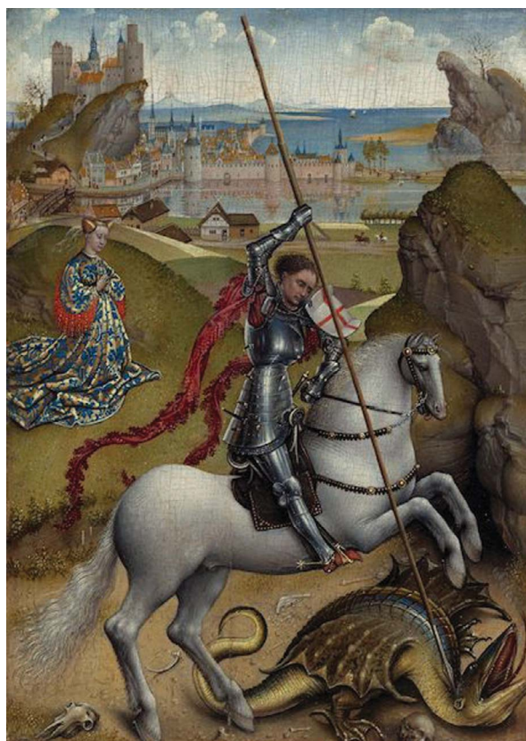
6. Rogier van der Weyden, Saint George and the Dragon , ca. 1432–1435, oil on panel, 14.3 × 10.5 cm, National Gallery of Art in Washington.

was Israhel van Meckenem. His Madonna of the Rosary (or Virgin of the Rosary ), ca. 1480, 51 inspired the ivory plaque, now in Museo Nazionale del Bargello 52 and the pax in the parish church in Noirétable (France, dep. Loire). 53 The compositions of the ivories follow closely the arrangements of the engravings, with perhaps just a few changes in the layout determined mostly by the differences in the medium and size. Engravings were the most replicated models for the fifteenth and sixteenth century ivories but certainly not the only ones. Richard Randall also pointed out that many such ivories were products of Dutch origin, attributed primarily to Utrecht workshops, and were modelled on panel painting, especially that of Jan van Eyck. 54 On the left wing of the diptych in Princeton, 55 Saint George killing the dragon is presented (see: Fig. 5). This image copies directly the composition of the lost picture painted by Jan van Eyck, known from its copy by Rogier van der Weyden, kept today in National Gallery in Washington (see: Fig. 6). 56 In Toronto,